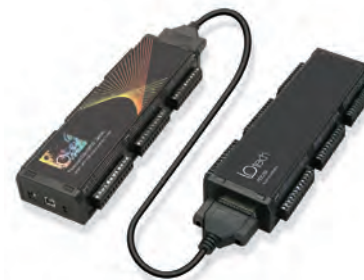
Personal Daq/3000 attached to a PDQ30 expansion module via a CA-96A cable

Unique to the Personal Daq/3000 Series is a low-latency, highly deterministic control output mode that operates independent of the PC. In this mode digital, analog, and timer outputs can respond to analog, digital, and counter inputs as fast as 2 \mu s; at least 1,000 times faster than other products that rely on the PC for decision making.